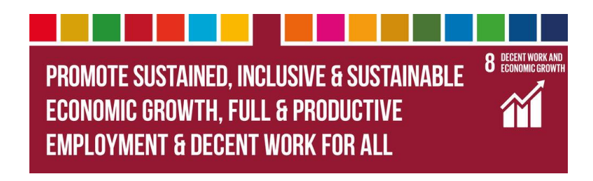
Figure 3. The UN Sustainable Development Goal 8 (SDG8)

Nowadays, both CSR and HRM must face different challenges from a competitive and global point of view, the UN Sustainable Development Goals appearing as a mandatory reference. Among those objectives, the SDG 8 appears as especially relevant: promote sustained, inclusive and sustainable economic growth, full and productive employment and decent work for all (Figure 3). "Decent" and "sustainable" work is understood as that which provides a fair income, security in the workplace and social protection for families, thus offering better prospects for personal development and favouring social integration. All women and men should have equal opportunities in the workplace and governments can work to build dynamic, sustainable, innovative and people-centred economies, specifically promoting youth employment and women's economic empowerment, as well as decent work for all, as the continuing lack of decent work opportunities, scarce investment and low consumption erode the basic social contract underlying democratic societies, that is, that we all should benefit from progress.