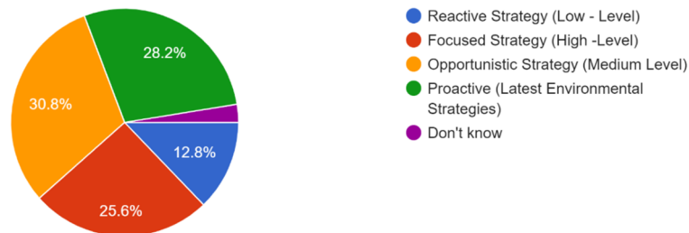
Figure 2. Analysis of opinion about ecofriendly strategies in Fashion Industry (Anon., 2021)