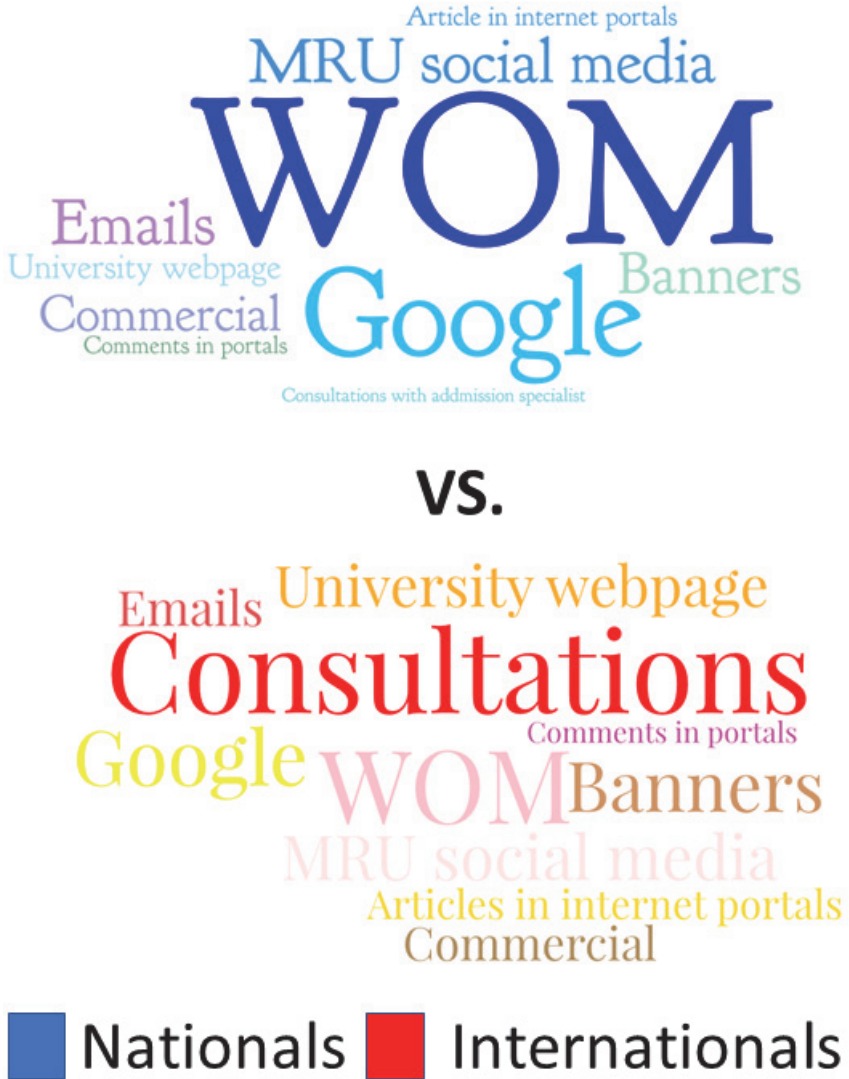
Figure 1. Sources of information regarding university studies

The results of the focus group show that before enrollment into university the students of the 2016 intake visited study fairs and other similar events (a study fair is typically a huge exhibition of study programs from different universities designed