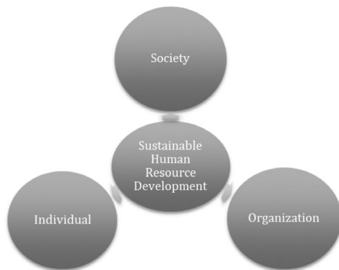
Figure 1. The Influence of Sustainable Human Resource Development (compiled by author)

positive and long-term influence in the aforementioned areas. Changes created via the development of human resources firstly make a positive influence on the individual who becomes more capable to meet the changes at work. This positive attitude is then transferred to the organizational level and to the family (or broader society) level.