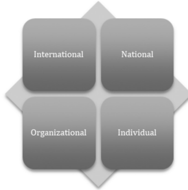
Figure 3. Levels of Sustainable Human Resource Development (compiled by author)

It is important to ensure the planning of sustainable human resource development on all levels: international, national, organizational, and individual.