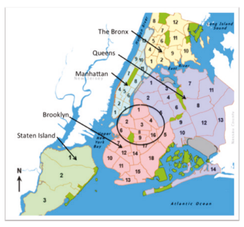
Figure I. Map of New York City Boroughs and Districts. Image entitled "NYC Community Data Portal" used with permission of the New York City Department of City Planning. All rights reserved.

The hospital analysed in the paper is located in central Brooklyn, one of the five New York City boroughs: Brooklyn, Manhattan, Queens, Staten Island and the Bronx. The geographic relationships of the boroughs are shown in Figure I.